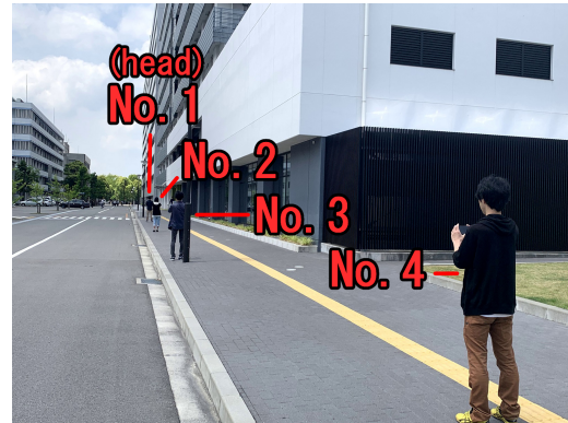
Figure 2: Appearance of experiment